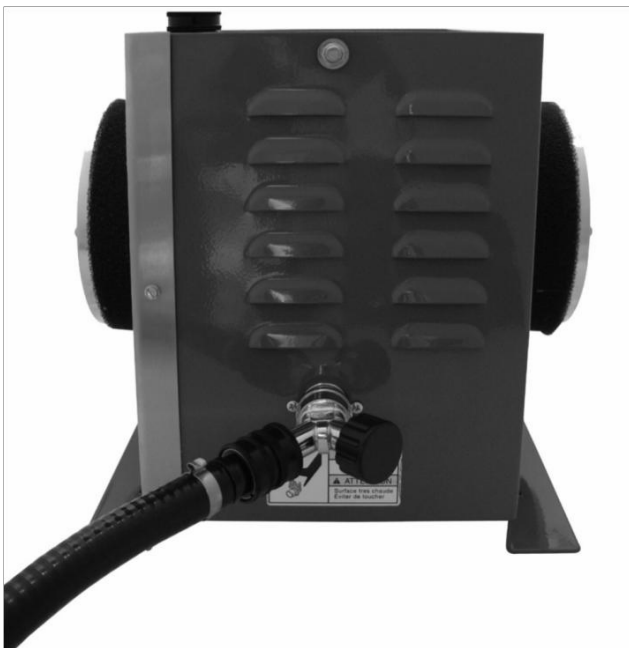
“Y” Connector with single hose and cap

Remember, we do not recommend using the “Y” connector with turbines smaller than 4 or 5-stages. This is due to the power that each model has. The more stages you have the more power you have. When you are running two spray guns on a single turbine you are splitting the air power that turbine has. While you will not divide it equally, you will reduce it considerably, so make sure you do some test areas before you start on your project.