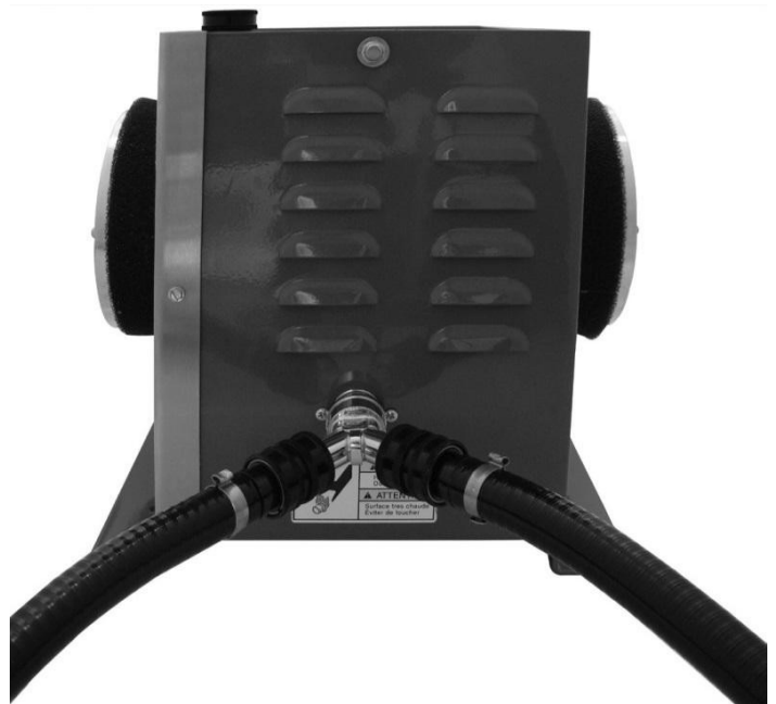
“Y” Connector with two hoses